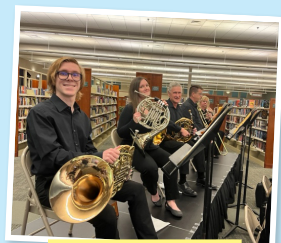
Hosted the Symphony in the Stacks with the Springfield Symphony Orchestra.