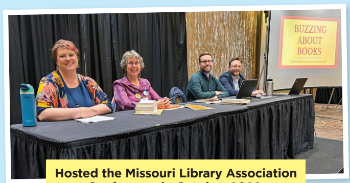
Hosted the Missouri Library Association Conference in October 2022.