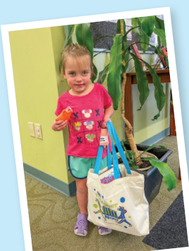
4,468 kids and teens completed the 2022 Summer Reading Program activities.