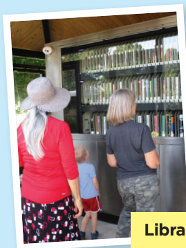
Library Express East opened in August 2022.

W elcome to the Springfield-Greene County Library District Annual Report for the fiscal year 2022-2023. Over the past year, your library has continued to serve as a vibrant hub of learning, discovery and community engagement. This report provides a highlight of our accomplishments, financials and impact as we strive to fulfill our mission of building a stronger community by enabling lifelong learning and enrichment. Thank you for your support and interest.