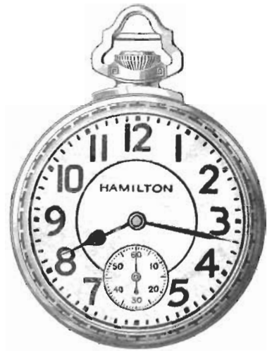
HAMILTON 992 RAILROAD MODEL

Here is the watch that Hamilton has designed especially for railroad men. The sturdily wrought case is fashioned of 14K Filled Gold and has a unique pendant construction that is practically dust-proof. The bow is equipped with a special, adjustable screw bar which prevents bow pulling out.