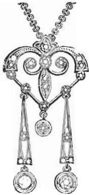
Diamond La Valliere, $140.00

In this fine jewel, three important and 20 smaller brilliantly cut diamonds are set in platinum mounting. It has two flexible pendants and a flexible drop.