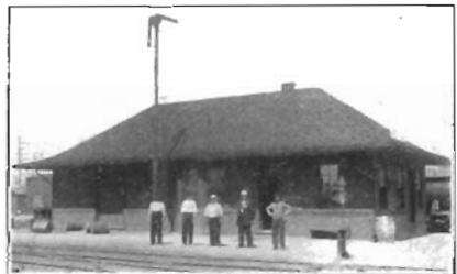
Depot at West Tulsa, Okla.