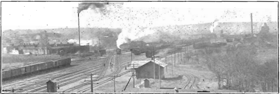
Frisco Yards, Monett, Mo.