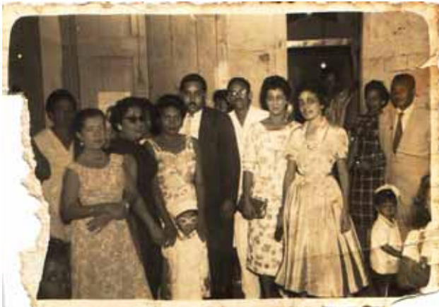
Family reunion in Santo Domingo. I'm with my Mother, dressed in white with hat and mask in front.

We had plenty of chores because we lived close to the beach. The houses in the Caribbean are mainly built with concrete because with the hurricanes you might lose them every year. Since we were close to the beach our house had to be painted twice a year. We had to help our father do that. We painted inside of the house once a year, but outside twice and that took awhile. The car had to be washed twice a week because of the sea salt and if you didn't want it to rust right in front of your eyes you had to do that.