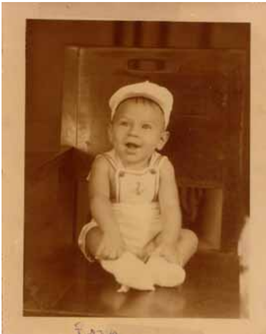
Me at five months old.

The first Alburquerque in history that we have found is the Viscount of Alburquerque in Spain and Portugal. According to the research I made in the 1970's the name was started in Spain with the Moors and it was Al-Bukir which was the name of a region in Lebanon. When the Moors were expelled from Spain everybody had to change their names to a Catholic name from a Moorish name so they changed Al-Bukir to Alburquerque and that is how the name originated. There is a town in Southern Spain called Alburquerque.