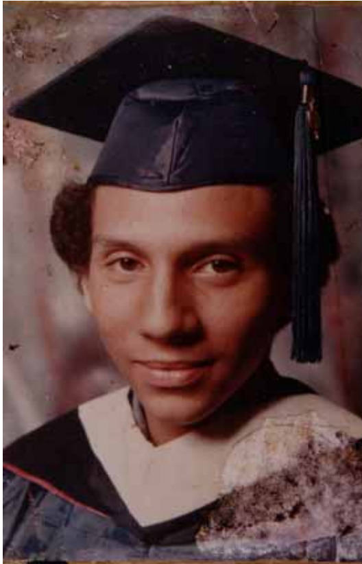
Me, High School Graduation. Levittown, Puerto Rico, 1972.

I always wanted to be a doctor and that started since my father had the pharmacy and I saw him preparing medications and all that. Every chance we got – me and my brothers– we liked to go to the pharmacy. We were fascinated with the old time pharmacies. Medicines were prepared and we saw him mixing things (you know, this much of this and this much of that) the old-fashioned way. And so I was fascinated with that. That made me decide to become a physician and my father encouraged me to do that.