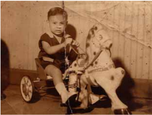
Me in my horse wagon. Santo Domingo, D.R. 2 years old.