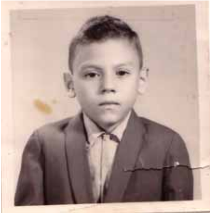
Me in 1964. Picture was taken for my passport.