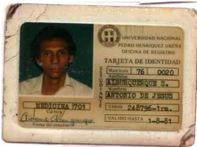
Medical school first year in Dominican Republic. ID card 1981

I have not yet realized my mission. I still have a lot of things to do. One of my dreams is having my own clinic – my own practice – where I can be my own boss and do my own hours and my own things and have my own equipment and train people to do things that I enjoy doing and helping people out. One day when I retire, I will probably do that. I probably will set my own practice. I don't know if it's going to be in the Dominican Republic or whatever, but the more I think about it, you're more independent if you do it elsewhere. Unfortunately, medicine here in our country is so regulated and there are so many guidelines and restrictions – things that you have to do because that's the law. Other things that you know they work and you know you can try this to help the person, but they won't let you. That sort of thing is sometimes frustrating.