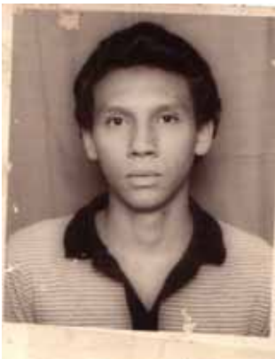
Me at 22 years old. Puerto Rico

When the opportunity came to go to Santo Domingo, I saw that that was probably the best way to do it. So I started there. When I arrived they looked over my transcripts and everything else and they said there are certain prerequisites that are different, so you need to complete these first before you get into the medical school, per se. The system is kind of a little different. So that is what I did and then continued it on. I attended college and medical school both: medical school in the Dominican Republic – college in Puerto Rico. I left my parents' home in 1983. I got my own apartment close to the medical school.