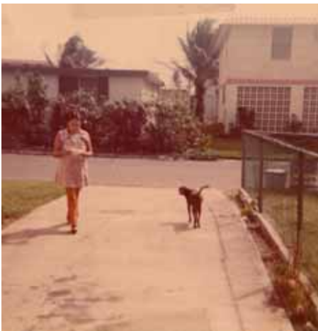
My Mother in our driveway picking up the mail. 1974 Puerto Rico (Neighbor's Dog)

I worked as a teenager. My first job was when I was 14 years old. We could not formally have a job when you were 14 in Puerto Rico. But, some of us would work as youth baggers at the supermarket. I guess they were authorized to have high school kids do it. So they had a Pueblo Supermarket in Levittown that was real close – maybe about a block away. So that was my first job – a part-time job as a bagger. I would take the groceries to the car. Soon after that I found a better job as a Fuller Brush salesman. I was also probably 15 or 16 and I used to sell different kinds of products. I was pretty lucky about that. I don't know if people felt sorry for me or what but I just did better.